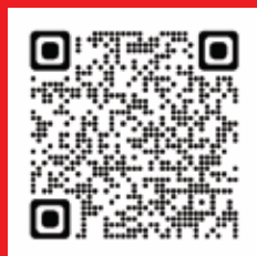
WHY CHOOSE OUR SIXTH FORM?